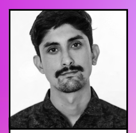
► Pejeperro Films